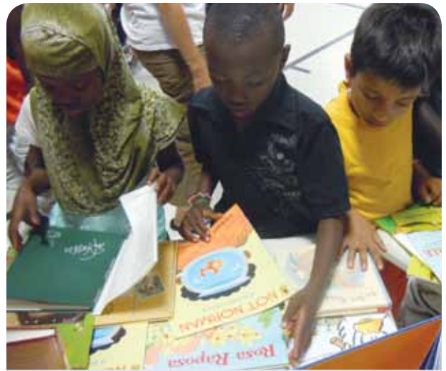
SOAR participants choose their new books at the Integrated Arts Academy in Burlington, VT