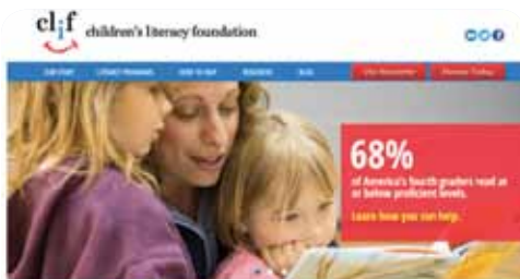
A peek at our new home page at www.clifonline.org .

We'd love to see you and hope you'll stop by our office in Waterbury Center, VT or attend a CLiF event soon. Until then, you can visit CLiF virtually at www.clifonline.org .