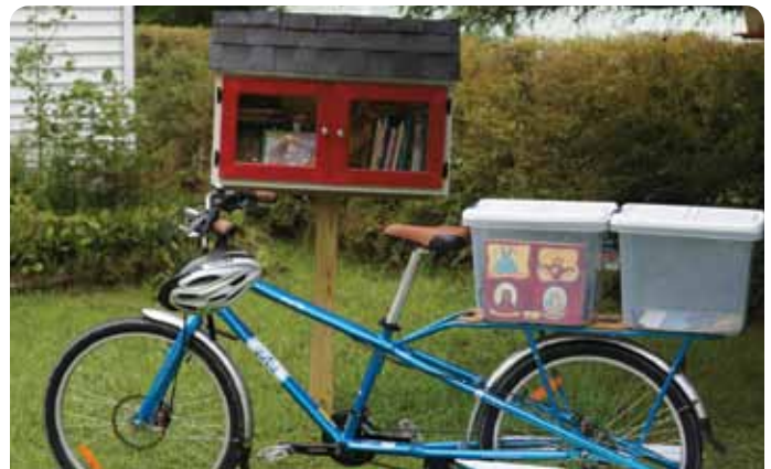
A Bolton Little Free Library and an ingenious delivery bike!