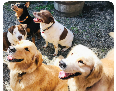
The CLiF Dog Team: Yoshi, Fern, Delphi, Nala and Wilson

CLiF's website got a makeover! Learn more about our programs, open grant applications, and CLiF's latest news at www.clifonline.org