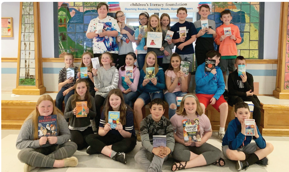
Boscawen, NH students show off their new books from the CLiF Year of the Book