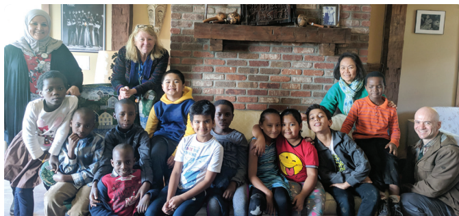
JFK Elementary's English Language Learners Class Visits the Clemmons Family Farm in Charlotte, VT

The Allenstown Elementary School (NH) fourth-grade teacher who lead the Boston trip described the outcome of the project and the culminating field trip: "This project not only opened up a new world of learning for my students but made me a better teacher. I now have a collection of fabulous activities to deepen the depth of knowledge my students have on how to read literature about history. They can now look at more than one perspective and respect the fact that everyone thinks differently."