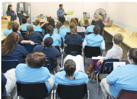
Incarcerated parents attend a CLiF seminar on connecting with kids over books

CLiF's innovative Children of Prison Inmates program (COPI) is growing yet again. We recently began a new long-term partnership with the New Hampshire State Prison for Women (NHSPW) in Concord, NH . CLiF is now operating multi-year programs in five prisons across the Twin States.