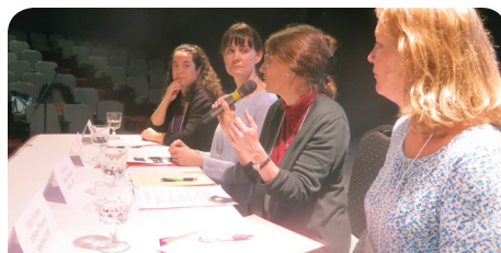
Panelists discuss issues facing libraries at CLiF's Rural Libraries Conference

Hour. Participants said, "I enjoy meeting librarians from other states and opportunities for networking," and "Great energy, helpful ideas, practical ideas we can do."