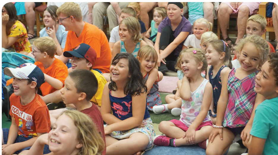
Young readers and writers listen to a CLiF Summer Readers presentation

Thousands of CLiF books travel far and wide each summer to eager young readers in all corners of Vermont and New Hampshire. CLiF presenters and book giveaways pop up in unexpected places each summer: a rustic camp lodge on the shores of Lake Champlain, a very hot auditorium filled with excited kids in Winooski, a small island in the middle of a NH lake, one rainy day in a locker room at a public pool in Barre, VT, as well as schools and libraries in towns and cities across the two states. We love to celebrate the diversity of programs and locations that we visit each summer and the thousands of kids and families served by CLiF's Summer Readers grant.