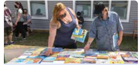
Parents at Lamoille County Early Learning Center in Morrisville, VT pick out new books for their kids

came to a close, CLiF hosted a storytelling event and book giveaway for the Lamoille County Early Learning Center through our At-Risk Children grant. This event put parents and caregivers front and center! The Lamoille County Early Learning Center offers Head Start educational services for children ages three to five and caregiver engagement opportunities. It was tough for adult family members to forge connections with each other during the most difficult months of the pandemic, and this outdoor, socially distanced event