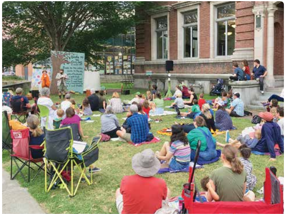
Families enjoy Frog and Toad in Burlington, VT

In 2020, theaters everywhere went dark. This past summer, audiences eagerly returned to live performances. The CLiF team was delighted to partner with Lyric Theater of Burlington, VT to give away free Frog and Toad books at their outdoor performances of the beloved classic series by Arnold Lobel. The cast sang and danced, inspired by A Year of Frog and Toad , which follows the seasons through the life of our favorite amphibian duo. During intermission, kids even learned one of the songs and dances. CLiF gave away roughly 600 new books to families at the six performances in and around Burlington, including at Fletcher Free Library and the Shelburne Museum. Families were thrilled to get outside and enjoy live theater, and the kids were especially excited to add new books to their collections! The events kicked off a busy summer of storytelling