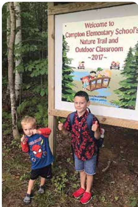
Students in Campton, NH at the story walk created by their Year of the Book grant

Because CLiF believes strongly in creating a culture of literacy, we introduced two grants that allow more creative, individualized, community-based literacy support. Our Community Building grant offers partners funding to more formally connect children with their own community through programs such as Senior Reading partners, Pen Pals, 1,000 Books Before Kindergarten, and songwriting and poetry workshops. Our Revive Your Literacy Programming grant gives $500 to those groups that have partnered with CLiF in the last five years to reboot activities started during their CLiF grant.