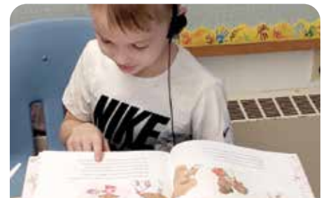
A young reader in Brownsville, VT practices reading

CLiF celebrates our partners for all they can accomplish with some funding, their knowledge of their community, and their own creativity!