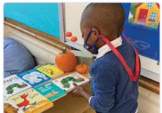
A young reader in Burlington, VT picks out his new books

See the map on P. 7 for our 13 current Year of the Book school partners, and stay tuned for more stories of creativity and tenacity from communities working through another year of COVID restrictions to celebrate a culture of literacy.