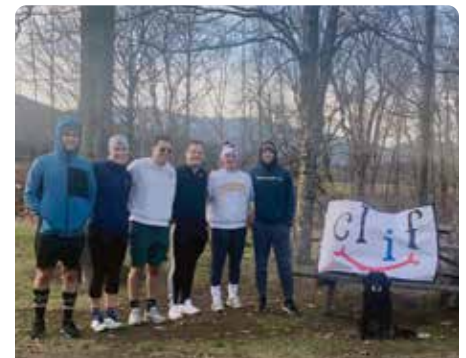
Runners who sponsored CLiF's At-Risk Children Program in Middlebury, VT